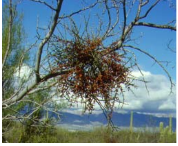
True mistletoe aerial shoots with berries.