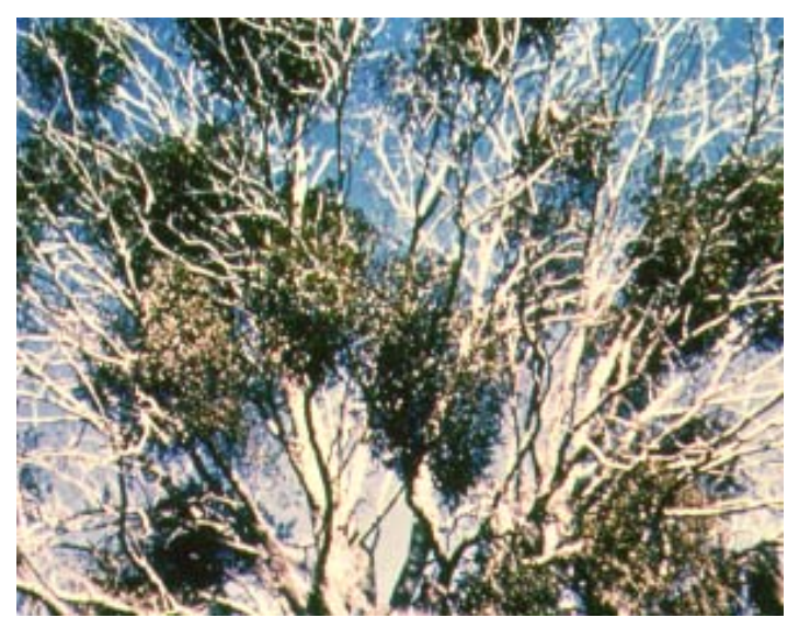
Multiple infections of true mistletoe.

Area wide efforts to clean out trees in an entire neighborhood or development may be effective in preventing infections in new trees, but requires the cooperation of a large